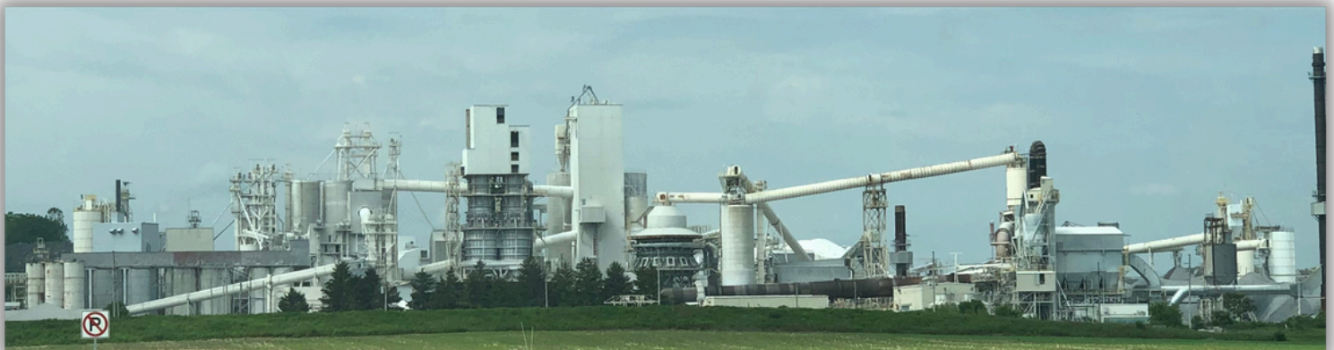
Long Distance Conveying & Storage