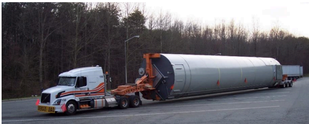
Shop Welded, One Piece Silos