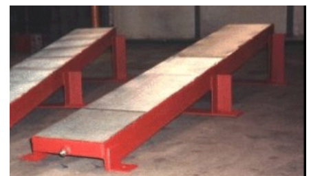
Flat Bottom Silo Aeration Trays

Delta Ducon 11 General Warren Blvd, Malvern PA 19355 Phone: 610.695-9700 Fax: 610.695.9724 www.deltaducon.com