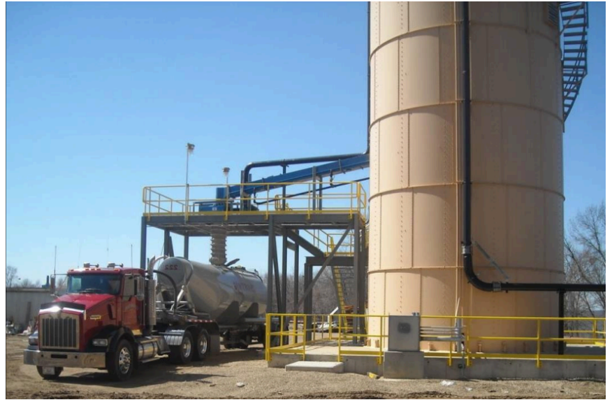
Air Slide Conveying to Dry Silo Unloading Spout