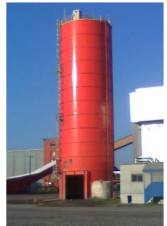
Field Bolted Silos