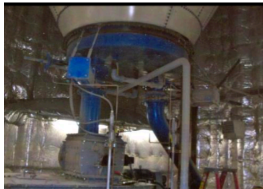
Conical Silo Aeration Bottom