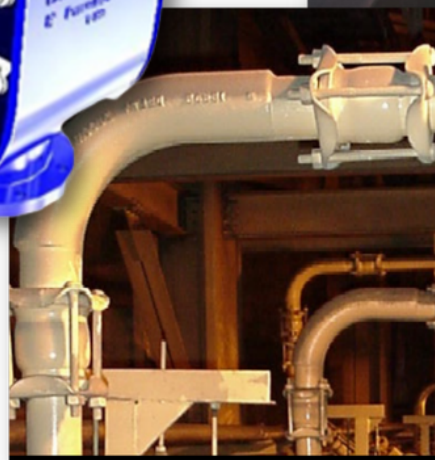
Abrasion Resistant Equipment