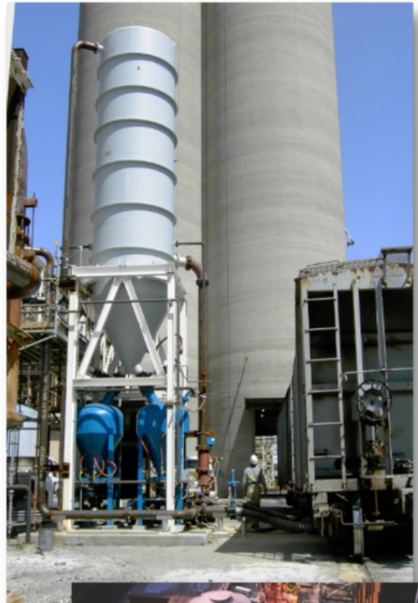
Rail & Truck Unloading